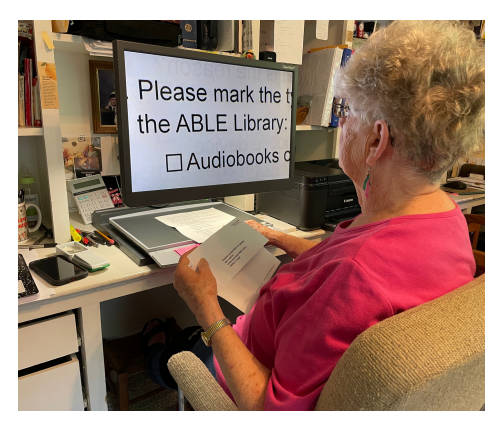
A SMART client demonstrates her use of technology.