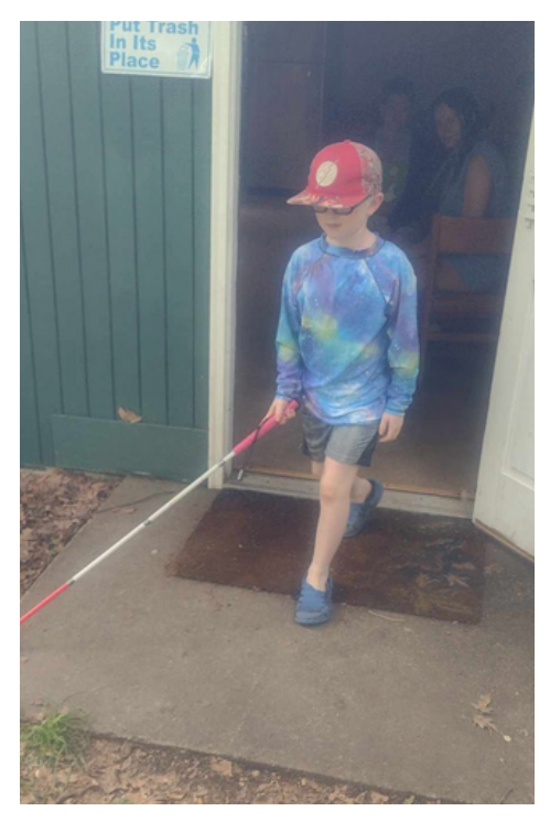
An IRLE camper uses a white cane.

There were three options this year for the summer LEAP (Learn, Earn and Prosper) job training program: virtual, in-person residential or work in their own community. LEAP is run by ReSource and DBVI with VABVI acting as consultants. VABVI identified 22 potential students to participate in the LEAP summer employment program for ages 14-22.