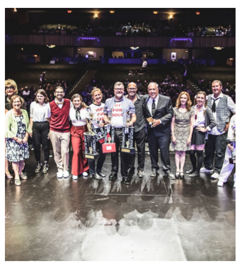
DWTBS participants pose onstage at the Flynn.