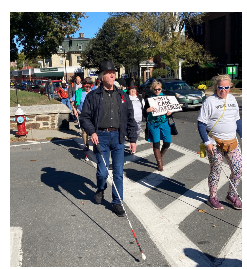
A White Cane Day participant crosses the street.