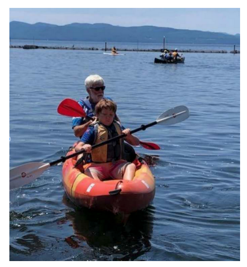
An IRLE camper kayaks on Lake Champlain.

VABVI partnered with DBVI to hold White Cane Awareness Day events in Brattleboro, Rutland, Burlington, Barre, Lyndonville, and St. Albans. All the events are designed to increase awareness of people who have visual impairments in the community. In 2024, we celebrate the 60th anniversary of WCD.