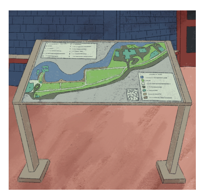
An illustration of the Accessibility Project's Waterfront sign.

A sign listing VABVI's mission statement in several languages commonly used by Vermont's New Americans.